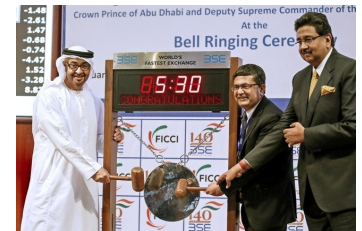
Crown Prince of Abu Dhabi at BSE, Mumbai

The two leaders welcomed the opening of UAE-headquartered company, DP World's new smart port Nhava Sheva in