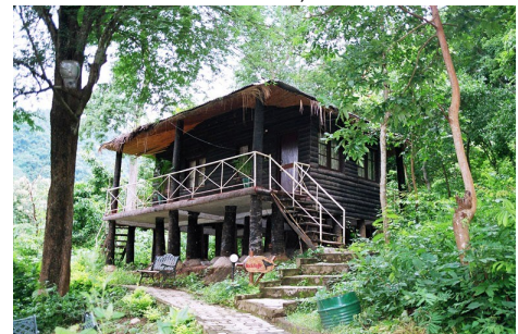
Jungle Bells Nature Camp