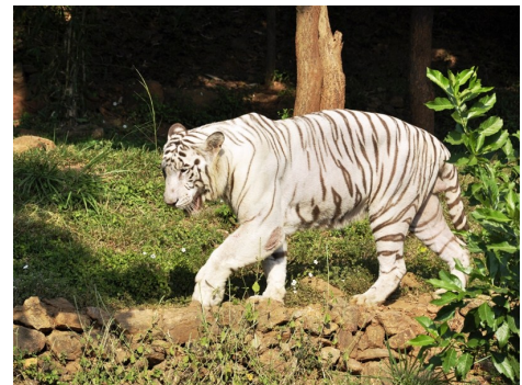
Indira Gandhi Zoological Park