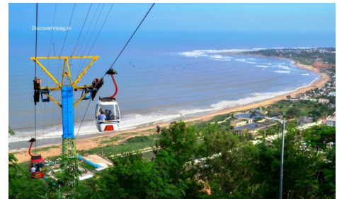
Kailasagiri Hill Ropeway Service