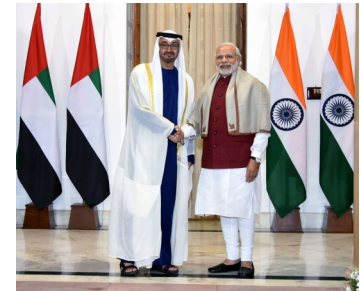
Prime Minister meets Crown Prince of Abu Dhabi

Prime Minister Modi and Crown Prince held wide ranging discussions and exchanged views on bilateral, regional and multilateral issues of mutual interest. The two leaders announced their decision to enshrine the new strategic direction of the UAE-India relationship in a Comprehensive Strategic Partnership Agreement setting out the basic principles of the partnership and outlining a roadmap for deepening cooperation. Prime Minister highlighted the major initiatives taken by the government to improve the ease of doing business in the country and invited UAE to be partner in India's growth story and to participate in projects creating mega industrial manufacturing corridors. The Crown Prince commended Prime Minister Modi's dynamic initiatives "Start up India", "Make in India", "Smart City" and "Clean India", noting their strong potential to provide India's US$ 2 trillion economy a positive impetus for growth and to accelerate progress in bilateral cooperation between the two countries.