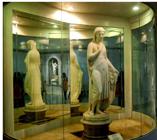
Statute of Veiled Rebecca in Salar Jung Museum