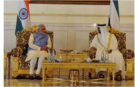
Prime Minister meets Crown Prince of Abu Dhabi

Prime Minister Shri Narendra Modi also visited ICAD residential city in Abu Dhabi and interacted with Indian workers. A longstanding wish of the Indian community to have a temple in Abu Dhabi was fulfilled with the announcement by the government of UAE to allot land for the purpose during the visit. He addressed Indian diaspora at Dubai International Cricket Stadium on August 17 where about 50,000 members of Indian community were present.