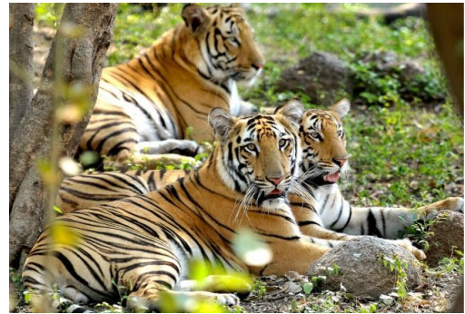
Nehru Zoological Park

Golconda Fort, Qutub Shahi Tombs, Chowmohalla Palace, Taramati Baradari, Mecca Masjid, State Archaeological Museum, Nizam's Silver Jubilee Museum,HITEC city, Laad Bazaar and Birla Planetarium are other tourist attractions in the city.