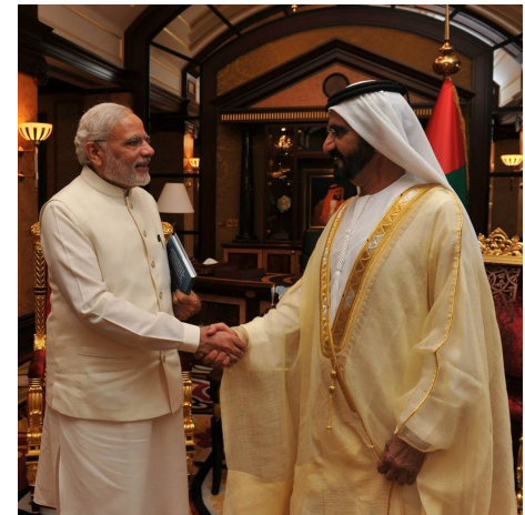
PM with VP and PM of UAE and Ruler of Dubai